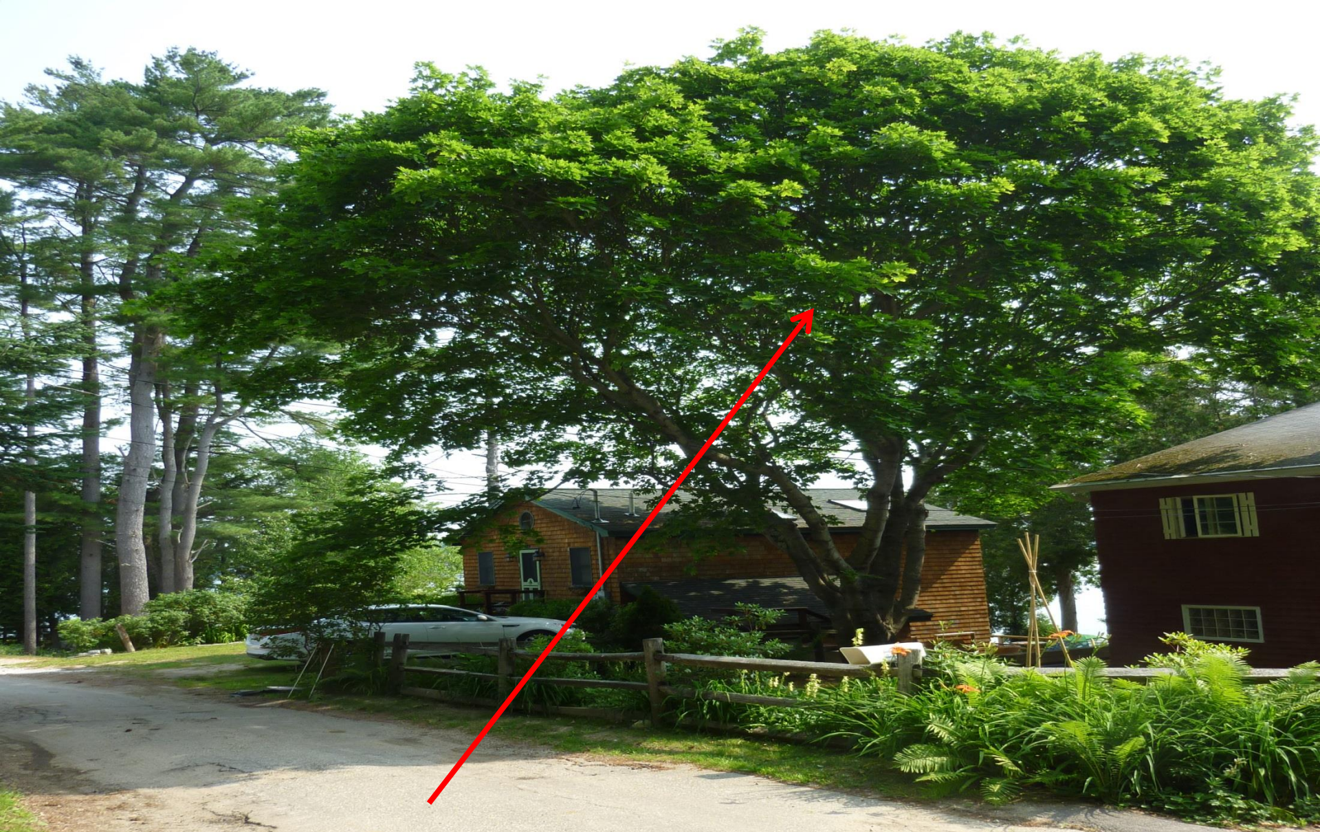
Thomas/Douglas maple tree